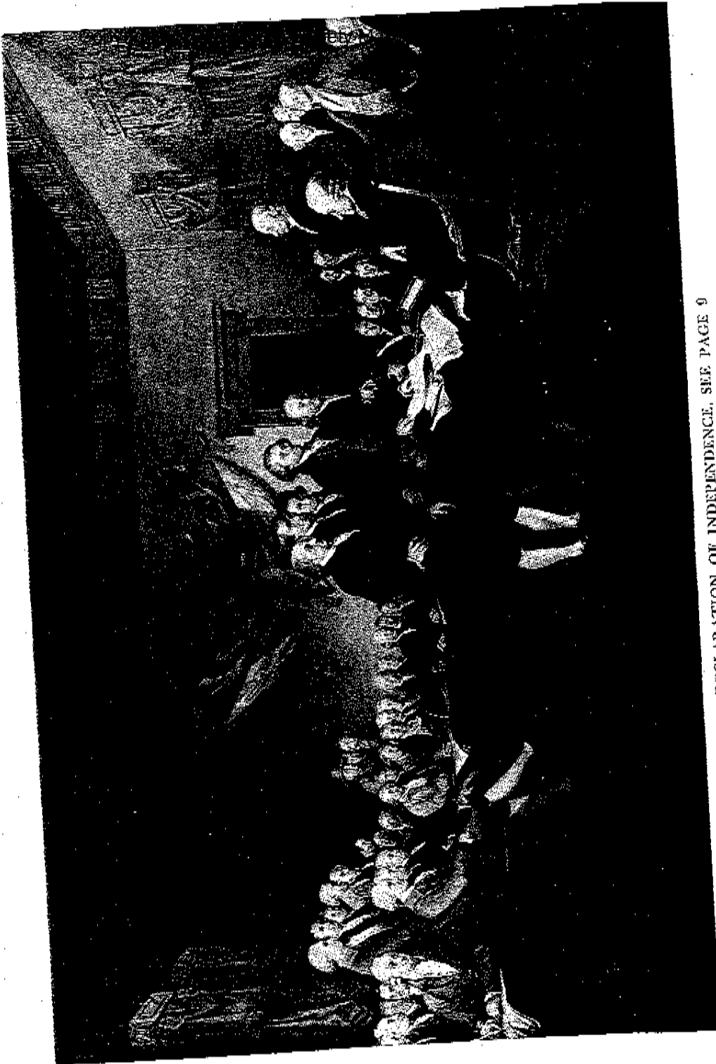
THE DECLARATION OF INDEPENDENCE, SEE PAGE 9